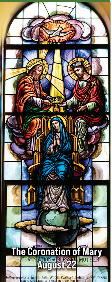
The Coronation of Mary August 22