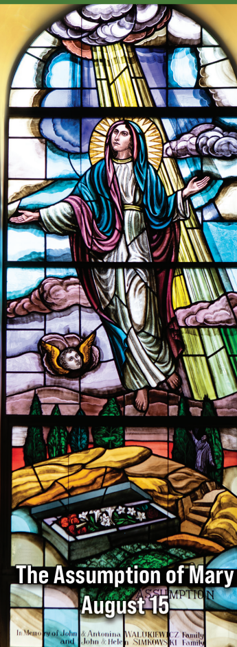
The Assumption of Mary August 15

"I have come to set the earth on fire, and how I wish it were already blazing! There is a baptism with which I must be baptized, and how great is my anguish until it is accomplished! Luke 12: 49-50